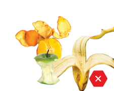
No Food or Liquids