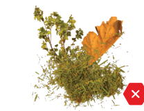
No Yard Waste