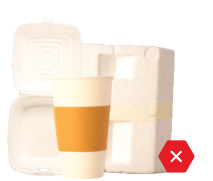
No Foam Cups & Containers