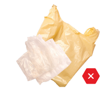
No Loose Plastic Bags, Recyclables in Plastic Bags, or Film Empty recyclables directly into your cart