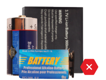
No Hazardous Waste or Batteries