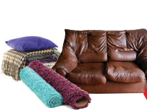
No Clothing, Furniture or Carpet